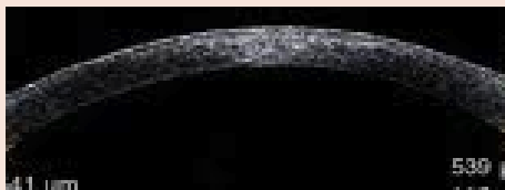
Figure 2a: Anterior segment optical coherence tomography of the right eye.