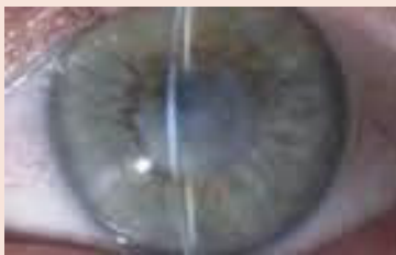
Figure 1: Pre-operative photograph showing the central scar.

A femtosecond laser assisted deep lamellar keratoplasty (FALK) provides multitude of advantages over conventional penetrating