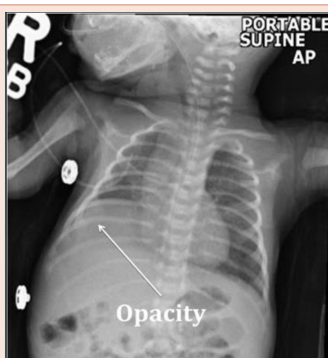
Figure 2: CXR on DOL# 21 showing RLL opacity.