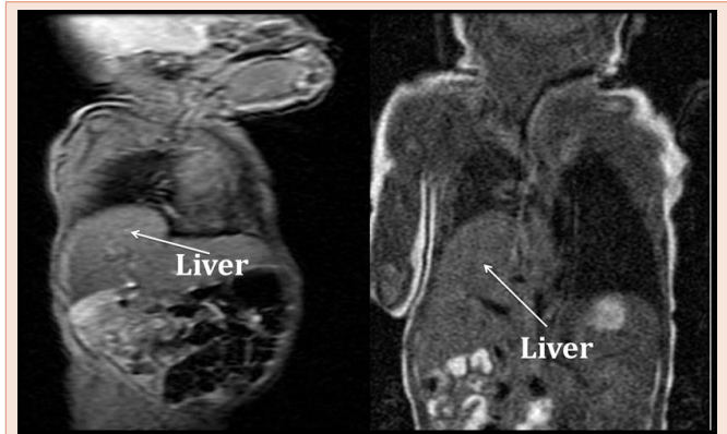
Figure 3: Chest MRI showing the RLL "opacity" to be the liver.

support and further developed a new right upper lobe atelectasis. With the family consent, the pediatric surgeon elected to repair the suspected right sided CDH. Thoracoscopy on DOL#56 revealed a right side diaphragmatic eventration instead of CDH. It was also noted that the atelectasis in the right upper lobe was significant. Therefore to prevent potential complications a right diaphragmatic plication was performed. The baby was taken back to the NICU for post-operative care. His respiratory distress improved after diaphragmatic plication and he was tolerating oral feeds by post-operative day #5. He was discharged home on post-operative day #8. Follow-up in the clinic thereafter showed appropriate weight gain and no respiratory distress at 2, 3, and 6 months of age.